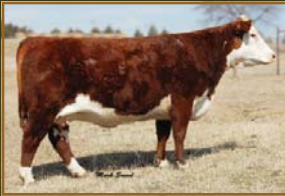
CRR D03 Cassie 206 Dam of CRR About Time

Tundra, Embracer 8006, Hard Rock, 146, 8203, Nitro, 29F, Pure Gold, Bright Future, Bailout, Easy Deal, Neon, BR Moler